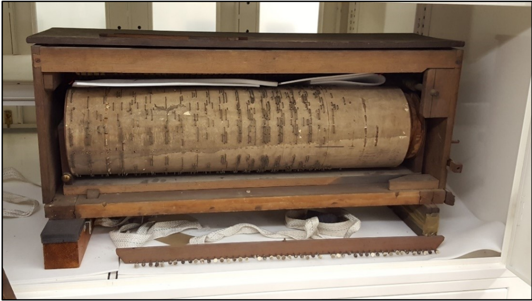
Figure 1a: Barrel Organ roll, part of W.37-1931