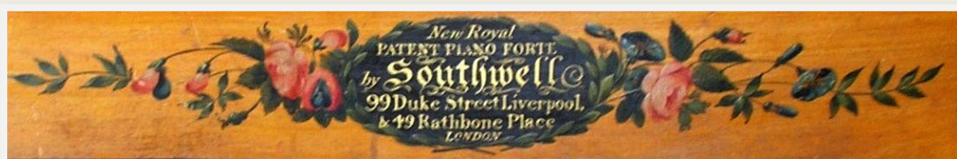
Figure 6: Nameboard of a square pianoforte offered for sale by Piano Auctions, London in 2010

Meanwhile, not later than 1808 Nicholas Southwell established a manufactory presence at 49, Rathbone Place, London (backing onto Gresse-street) in addition to his premises at 99, Duke-street, Liverpool. A square pianoforte dated 1808 and held in a private collection bears both addresses on the nameboard. 100 Another example offered for sale by Piano Auctions in 2010 also clearly shows both addresses (Figure 6).