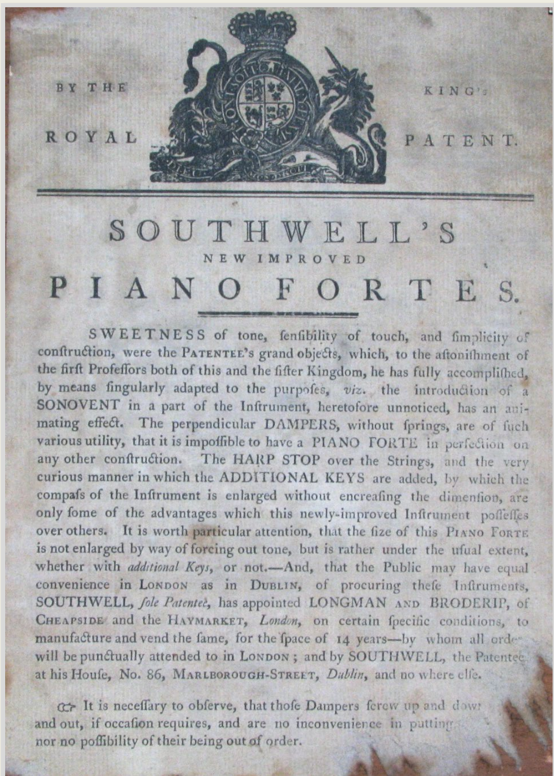
Figure 1: Flyer attached to a desk conversion of a Southwell square pianoforte, ca. 1794, inscribed 'Wm. Southwell, Dublin' on the nameboard.