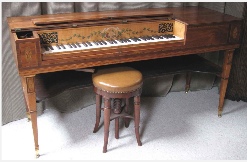
Figure 3: Square pianoforte (No. 2031) by Willm. Southwell & Son, dated ‘March 9 th 1798’

The earliest recorded serial number for a piano by ‘Willm. Southwell and Son ’ is No. 1617, held in the Cobbe Collection at Hatchlands Park, an unusual example since it has evidence of an altered lid, which it has been suggested may be the result of a factory alteration of an earlier five octave model. 57 The earliest dated example known to the author (Figure 3) that similarly bears the joint names is a five and a half octave square (No. 2031) signed and dated by a workman March 9 th 1798 on the side of a key. In this instance the ‘& Son’ refers to William’s son John – a partnership which was to endure until 1802. 58